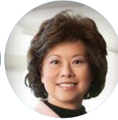
SECRETARY ELAINE CHAO U.S. Department of Transportation*