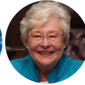
GOVERNOR KAY IVEY State of Alabama